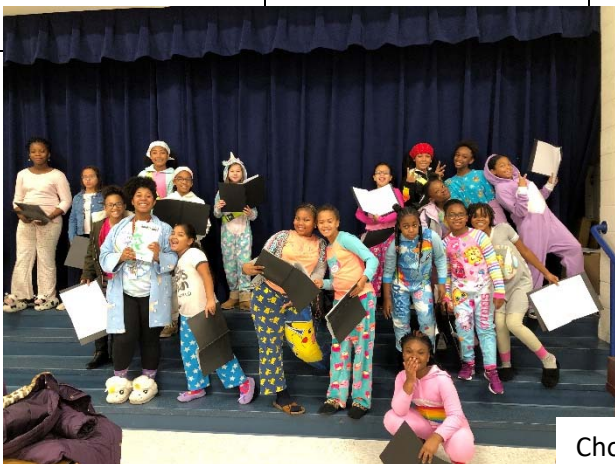
Choir Rehearsal in PJ's!